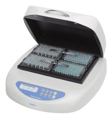
PHMP-4 thermoshaker for four microplates.