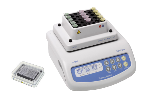
PCMT thermoshaker with cooling for microtubes and microplates.