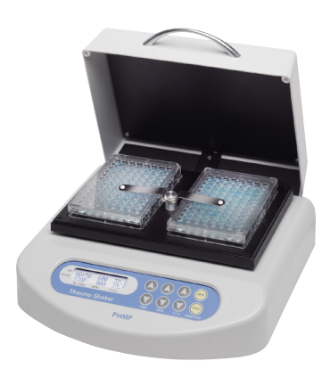
PHMP thermoshaker for two microplates.