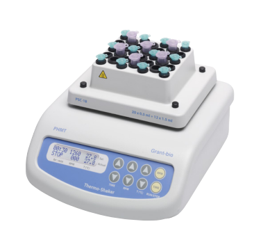
PHMT thermoshaker for microtubes and microplates.