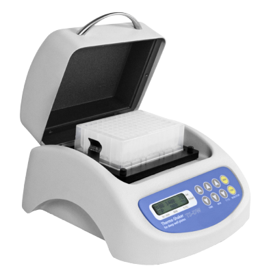
TS-DW deep well plate thermoshaker.