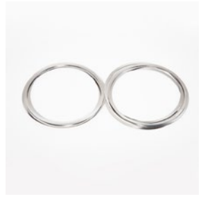
Corning X-Balance ring kit