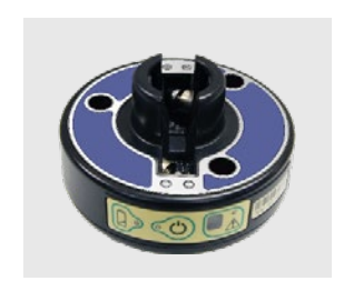
Corning X-LAB control module