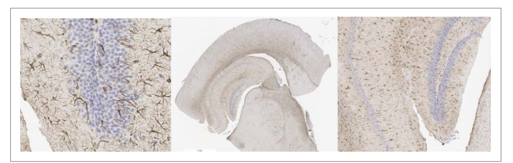
Figure 1C. Mouse brain tissue was cleared using the Corning 3D Clear tissue clearing technique. Cleared tissue was then reversed, embedded in paraffin, sectioned, and immunostained for GFP, labeling astrocytes. The Corning 3D Clear tissue clearing workflow does not affect antigenicity of tissues.