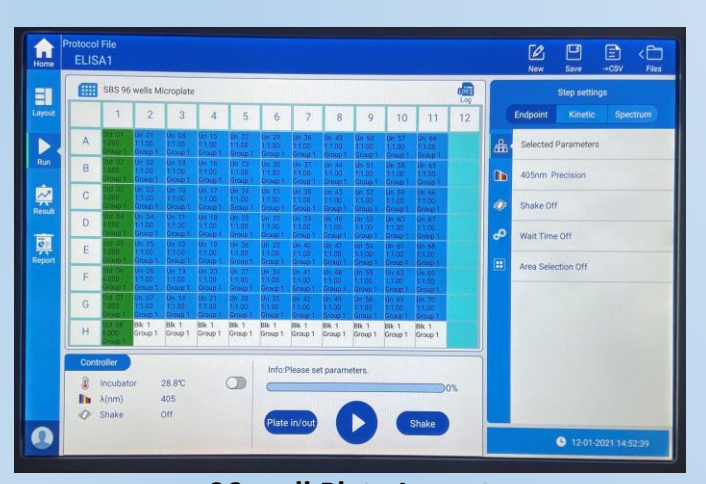
96-well Plate Layout Screen

The MR9610 is designed for efficient processing of multiple samples and accepts standard 96 well plates as well as 384 well plates for high density screening. The plate layout interface allows for a quick and intuitive setup of a plate well's contents. Users can highlight and label multiple wells to save time. The display shows a graphical representation of the plate. Users can label each well as required for: "known standard", "unknown sample", "blank well", "QC Control well", "positive control", "negative control", and "empty".