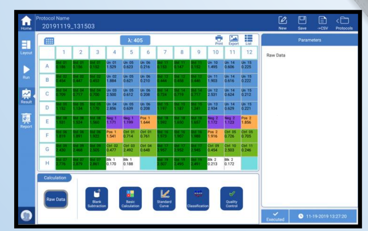
96-well Reading Result Screen