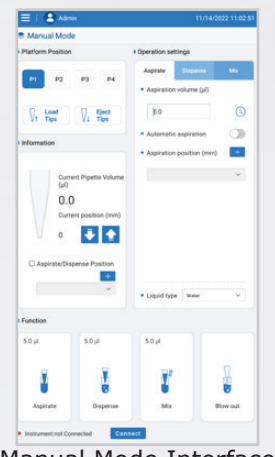
Manual Mode Interface