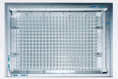
384 Well Microplate Adapter

All brands of microplates and reservoirs meeting SLAS/ ANSI formats are compatible for use with the AutoMATE 96. Included plate adapters allow 384 well microplates and PCR plates to be used.