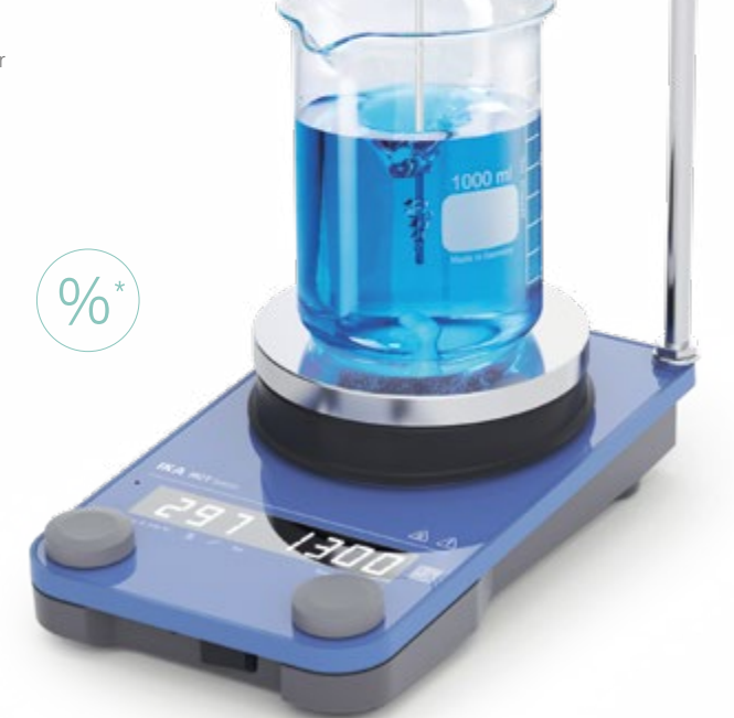
* Attractive total price compared to the sum of individual prices.

RCT basic Magnetic stirrer ETS-D5 Contact thermometer H 16 V Support rod H 44 Boss head clamp H 38 Holding rod