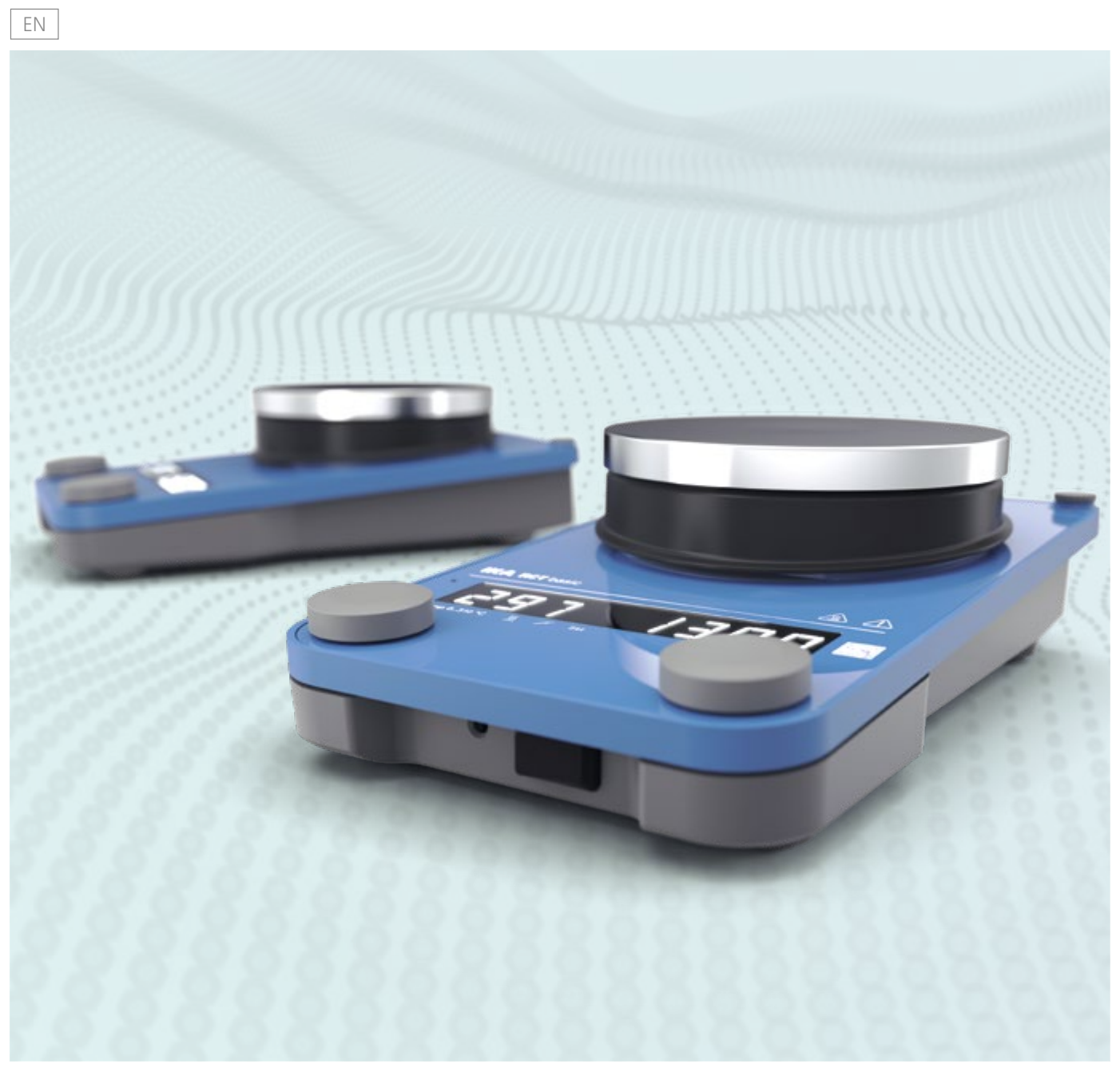
BESTSELLER RELOADED | RCT basic